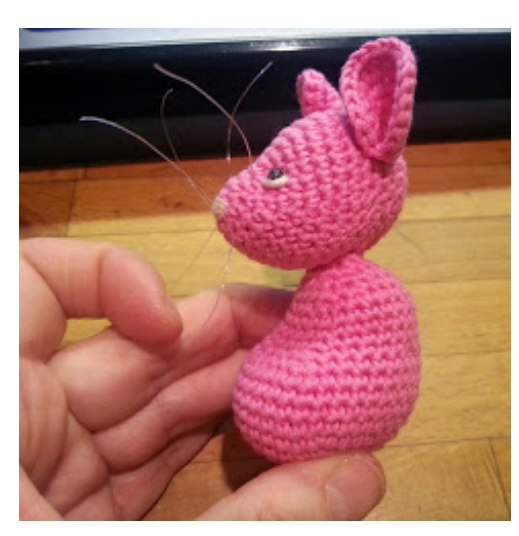
Sew the head onto the body.

Run the thread through the last stitches, leave a long tail and cut the thread. Remember to place the tummy in the front when you attach the head!