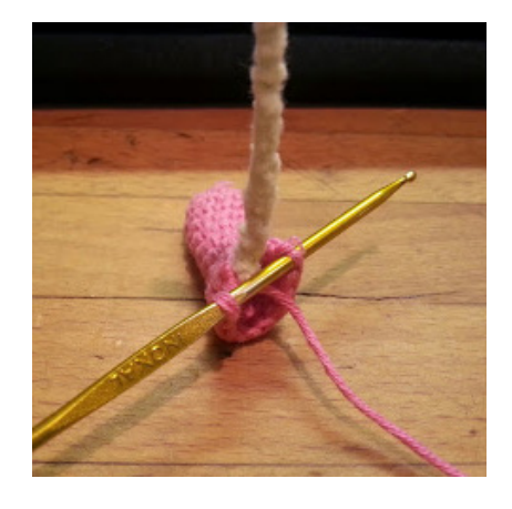
Insert the pipe cleaner into the paw and bend it so it stands up in the opening. Fasten with 1 sl st behind the leg.