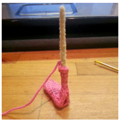
Crochet 5 sc over the opening and continue with five more rows of 5 sc each.

If you find it difficult, crochet a little bit looser than normal, or only in the front loop. Stuff the paw and sew the heel shut.