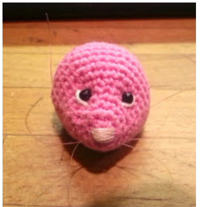
With the eye whites and the whiskers the forest mouse looks like this.

Attach the whiskers by sewing them back and forth before cutting.