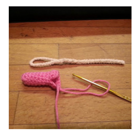
Fold a pipe cleaner equal in length to the paw, twist it at the end, and leave the rest.