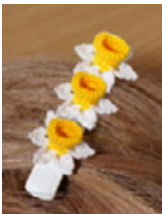
The daffodil used on a barrette!...

Cut the thread and hide the ends, or save some thread to sew the flower onto where you want it to be.