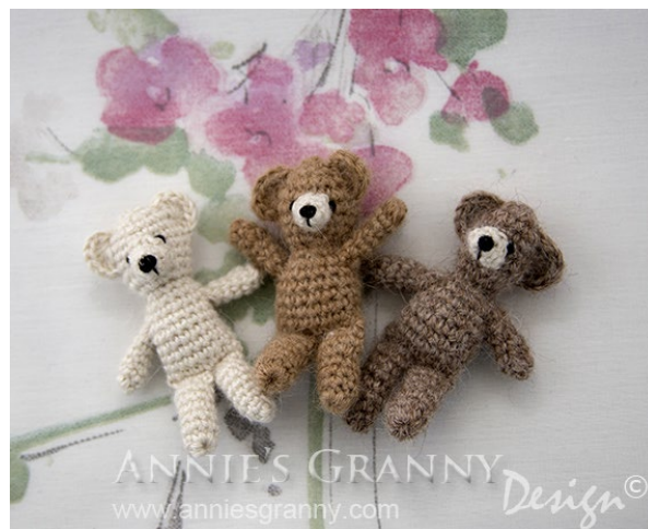
Three little bears crocheted with alpaca yarn.